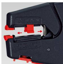
12 40 200: Adjustable length stop