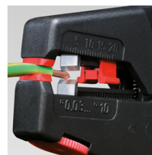
12 40 200: Precise stripping prevents damage to the conductor